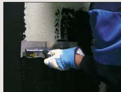
Application with a metallic plasterer