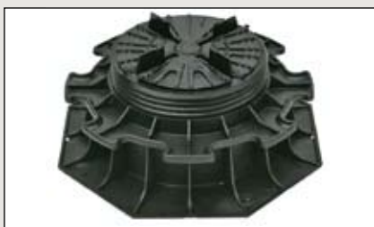
Plot Zoom adjustable paving support with Dalle Boise cushioning pad

Note: By reducing hygrometric exchanges with the ambient atmosphere, this spar varnish participates substantially in maintaining the dimensional stability of the wood slats.