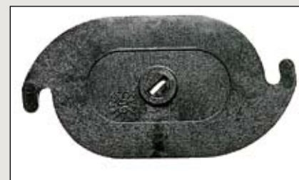
Tile connector locking Dalle Boise HR56 tiles together